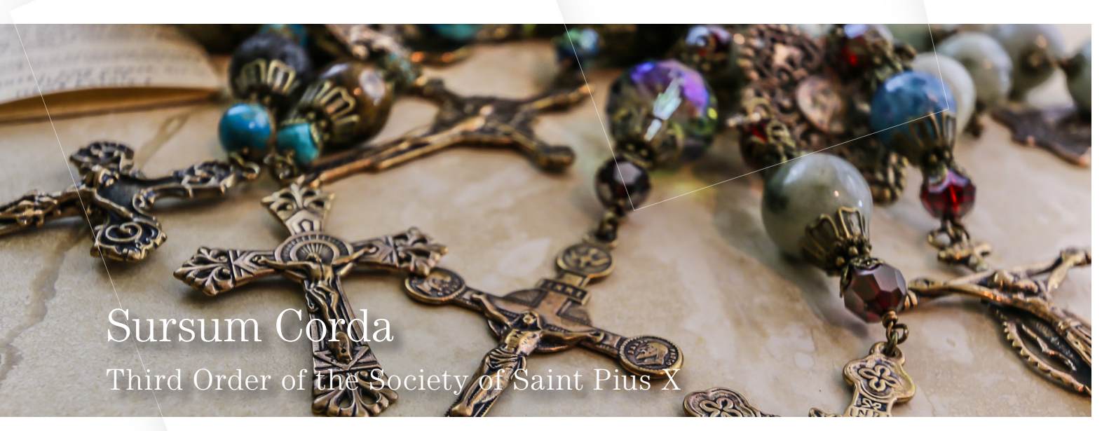
Number 25 - Autumn 2019 ::•